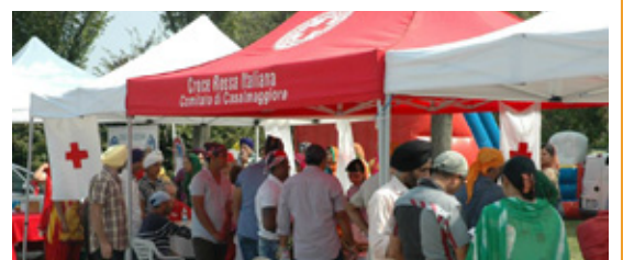
The Red Cross Charity were on hand to give free health checks