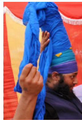
Many tried new styles of dastars for the first time