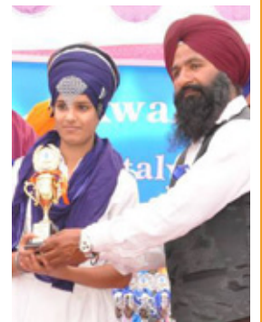
The Dastar and Dumala Competition was held by Sikhi Sewa Society Awareness Day