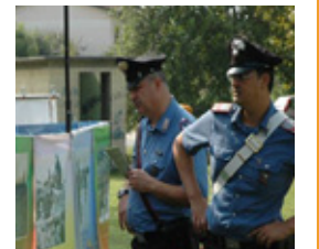
Italian Police take a look into the history of the Dastar