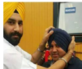
Noway, Oslo held its very own celebrations